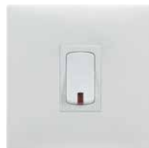
Switch 25 A with indicator