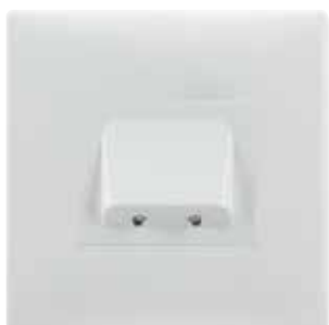
Skirting Light 2 M