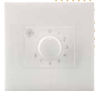
8 Step Fan Regulator