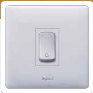
Screwless finish & rounded corners that add beauty to any home