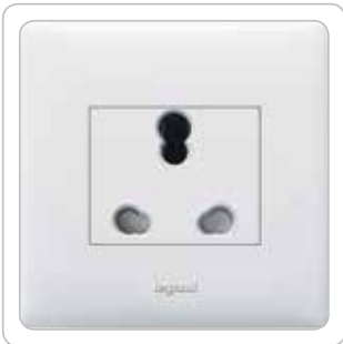
Safety feature for mishap-proof use