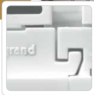
Linc-Loc™ intelligent design prevents wrong fitting, misaligned switches and sockets