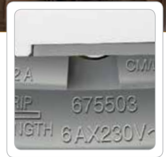
Laser marking safeguards against fakes