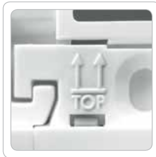
Indicators for correct orientation